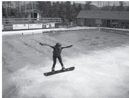
Perfect Form Landing in the Water

just like this. We ate the local fare in the evening by visiting the homemade Italian/Argentinean Pasta