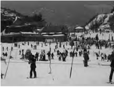
Beginner Land at Cerro Catedral

need to keep your sliding tool completely flat for 125ft., lock your legs, and take off into the air and land on your skis/boards. Fear, overcoming new unexplored sensations, being in the air, and landing upright are all experiences we do not normally partake of on a daily basis; and, thus, why this event will teach you more about your inner self, kinesthetic