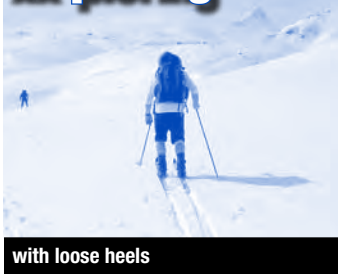
with loose heels