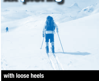
with loose heels