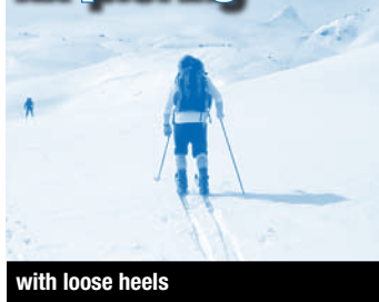
with loose heels