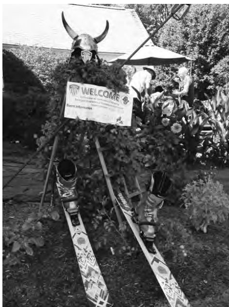
Nordic Man, knee dip or skinny dip party

I was just singing with my little boy what I thought was a few weeks ago, "School is out for summer, school is out forever" and now I sit here writing when school is back in and summer is out of here in two weeks. Up here in northern Vermont air and water temperatures start diving down very quickly. You snow seekers already know that there have been first snow falls in late August in the Wasatch and in southern Colorado's high peaks in the Silverton area. I would like to know how many folks took advantage of the May hail storms to get some sliding in on the lawn, fun but weird. Soon it will be time to venture out to Loveland, Copper, Brighton and some of the other resorts that open early in October and November. We can hardly wait. Predictions have an El Nino year and colder temperatures through the season. Let's hope there is snow with that cold because last season it was cold and light on snow for the early portion.