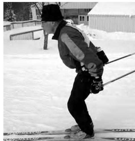
Double Pole Demo at Level II Exam

of teaching classic and skating head to Greek Peak and Garnet Hill both in New York. Another big push this season by areas is our adaptive Nordic education clinics. To date National has not made this into a Level I event but our content and practicing with the athletes makes this a very hands on and practical clinic. Look to Mt. Van Hovenberg in New York and Gunstock, New Hampshire for these clinics. Rikert and Trapp family lodge instructors have been eagerly coming back into the PSIA-E fold and wanting their staff to become certified. They want the best instructors they can have for their guests, able to market certified cross country instructors to lure more guests to their areas and they wanted the movement analysis with activities geared to that student so they walk away with a lasting moment. So look forward to an early Level II exam in January at Rikert in Vermont. Our Telemark schedule boasts two