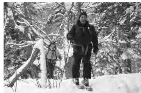
The summit, finally now we can ski down

Early Season Primers; one at Sunday River, Maine and the other at Seven Springs Pennsylvania, two of the far corners of the world. Get an early jump on skiing at these events. The Mini Academy and Pro Jam will be held once again at Killington, I hope we get another foot of snow like last year, minus the rain afterwards. Level I events are also on the schedule where we certify people who are ready or if not we give them a great introduction to how to learn to tele. These events are at great beginner teaching areas, Jiminy Peak Massachusetts, Gunstock and Mt Sunapee in New Hampshire and finally at Whitetail, Pennsylvania. Smugglers Notch and Jay Peak in Vermont as well as Saddleback Maine will be our hosts for our ever popular trees, bumps, steeps and exploration clinics.