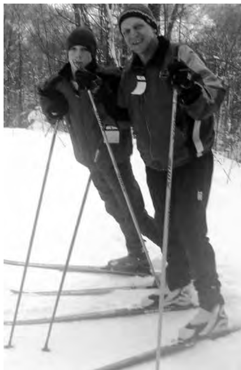
Join PSIA-E for a Level II!

their course descriptions to ensure you are prepared for the topic and skiing ability level needed for each course. Plus, in our study/exam guide we will have updated the exam portion, which we made changes to last season. This should be out around the end of October. It will include new exam score cards, on hill and for the participants, the topics/content that need to be passed, the agenda and descriptions of the interactive portions that the participants will be delivering. The Cross Country discipline will be updating scorecards for next year, and their study guide, as well.