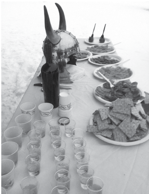
Nordic Party Spring Fling